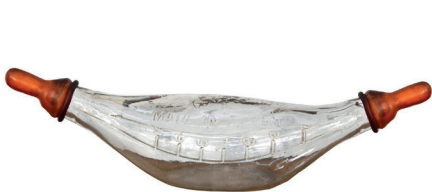
Victorian baby bottle

An artefact is an object from the past. Museums often display historical artefacts. Artefacts can tell us about how people used to live. Everyday objects like baby bottles, clothing, toys and books can tell us about childhood in the past.