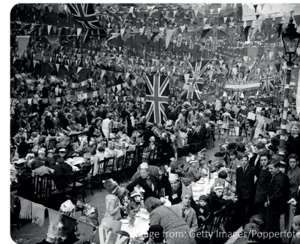
Street party to celebrate the coronation.