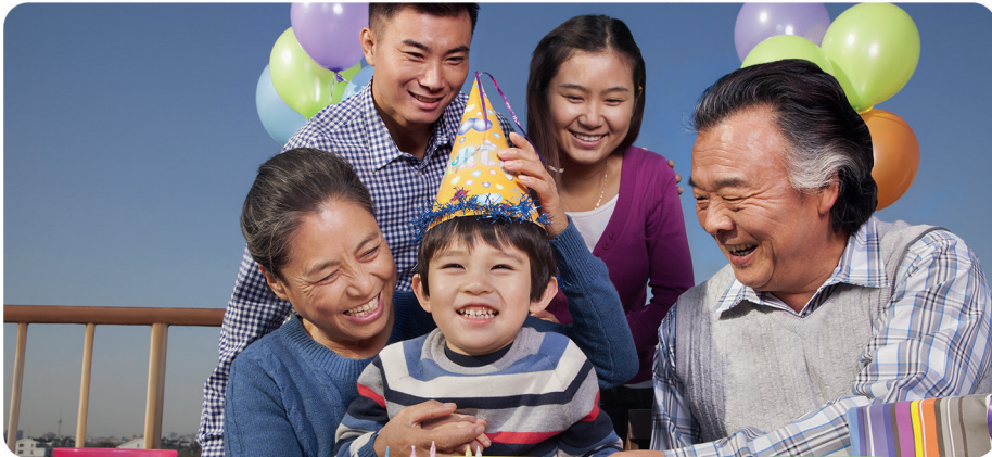
Birthdays happen every year.

Important life events include birthdays, religious festivals or family celebrations. Some life events happen every year and some happen at certain stages of human life.