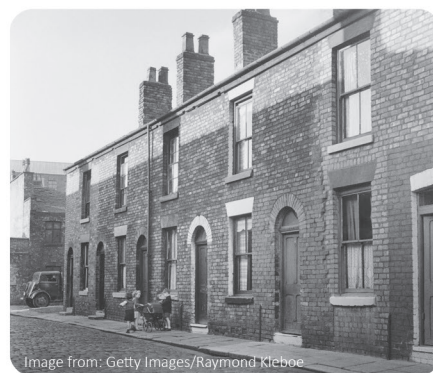
A street in the 1950s.

The way people use land changes over time. For example, in the 1950s there were fewer cars, so fewer roads were needed. Today lots of people have cars, so there are many more roads for people to drive on and driveways for parking.