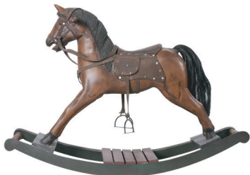
wooden rocking horse