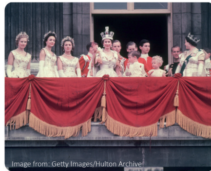
Queen Elizabeth II on her coronation.

A coronation is a ceremony where the crown is placed on the head of the new king or queen. Elizabeth II was the Queen of the United Kingdom for 70 years until she died in 2022. The coronation ceremony of Elizabeth II took place on 2nd June 1953 at Westminster Abbey, London. Many people celebrated the coronation by holding street parties.