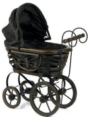
wood and metal pram