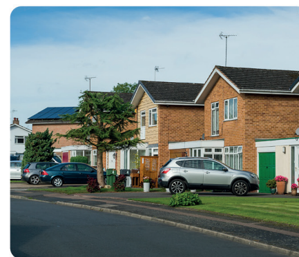
A street today.