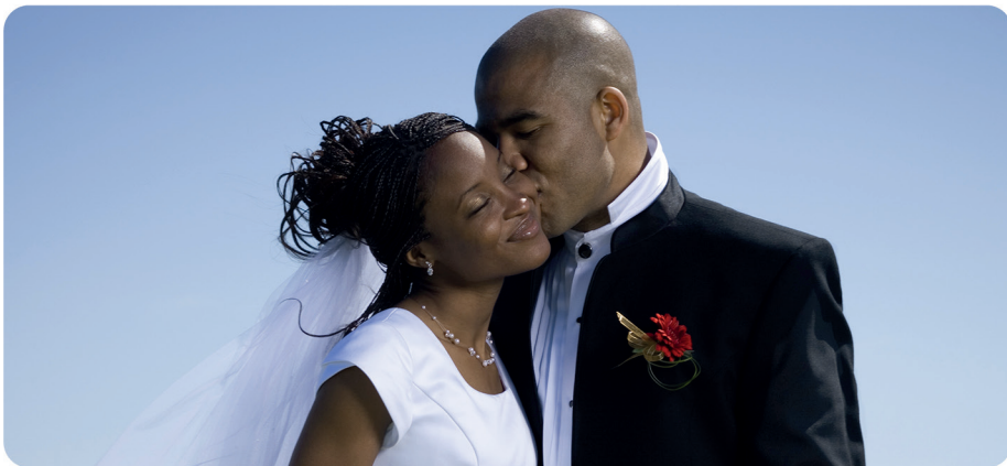
Weddings happen when two adults get married.