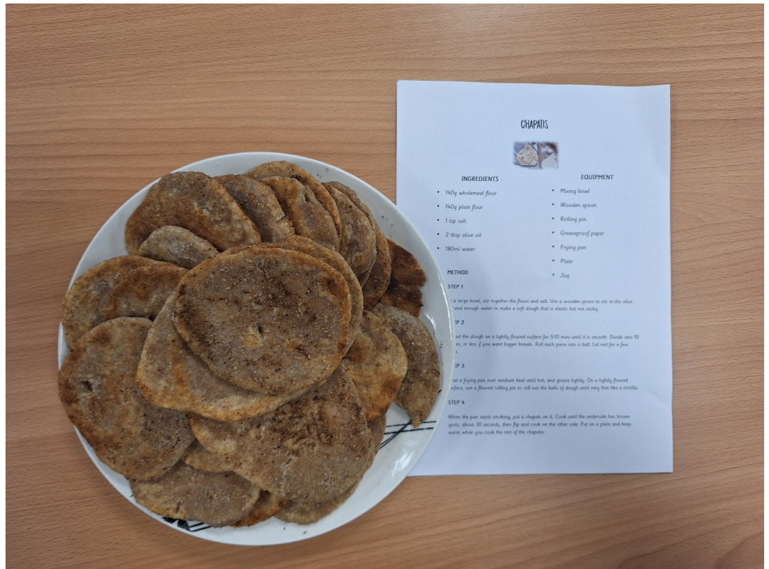
Chapatis made by Year Three and Four during their DT Project this week.