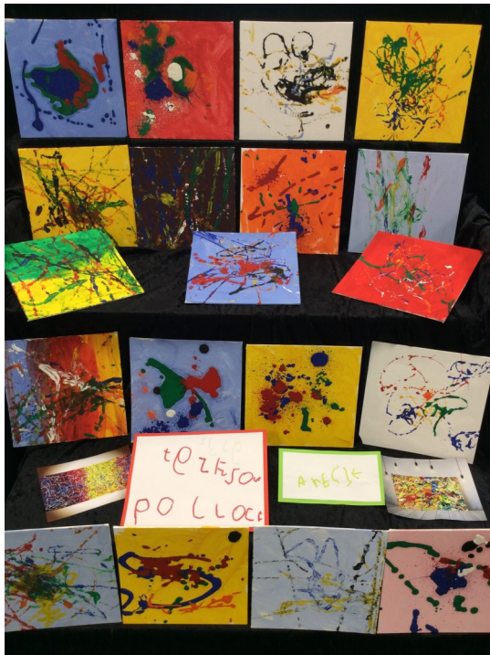
Pendennis class paintings in the style of Jackson Pollock.